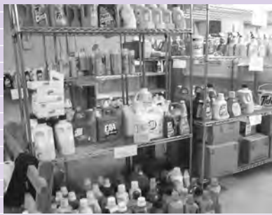
AFTER (see page 1)