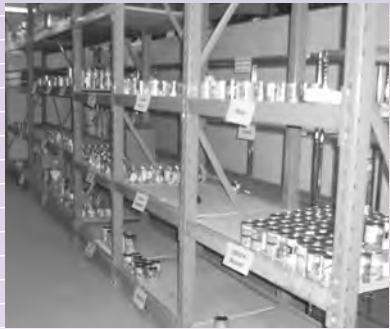
BEFORE (see page 2)

Serving the entire Lehigh Valley since 1900